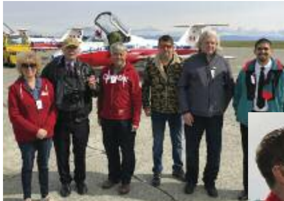
The Canadian flag flown the breadth of the country