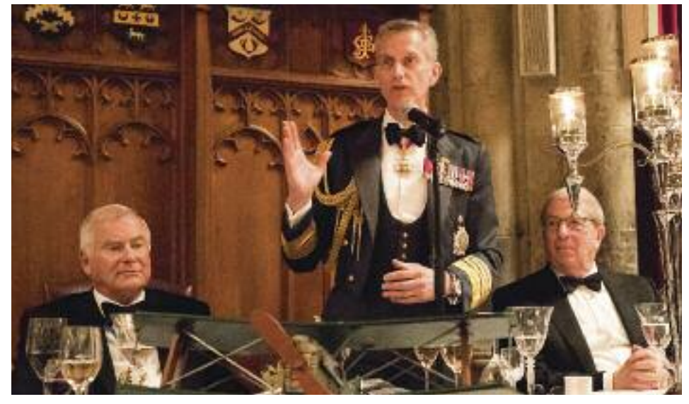
Sir Stephen in full flow