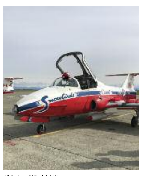
431 Sqn CT 114 Tutor

The tour started with a visit to 407 Squadron. This Aurora-equipped Squadron keeps watch over the Pacific Ocean looking for illegal fishing, migration, drugs and pollution in addition to looking for foreign submarines. After a short briefing on the history of this squadron, we were taken