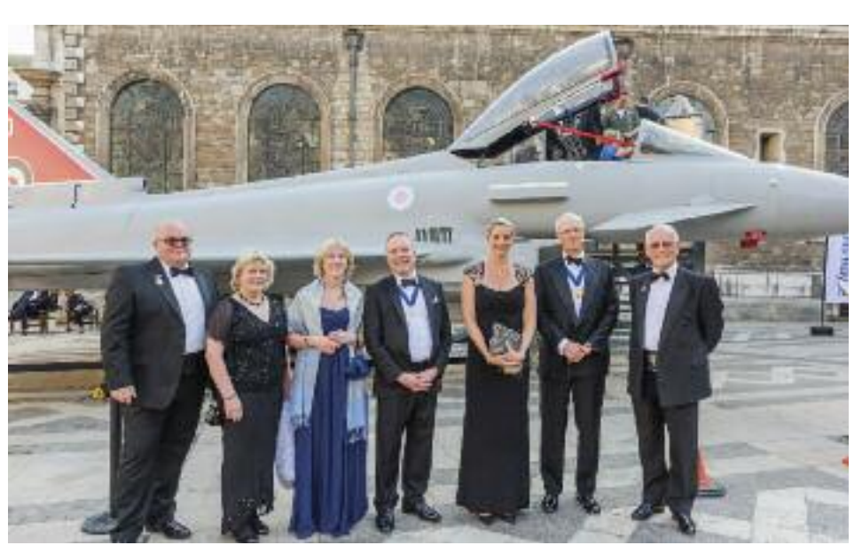
Air Pilots enjoying the pre-dinner sunshine