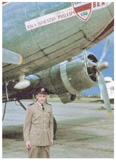
The speaker by a BEA Dak