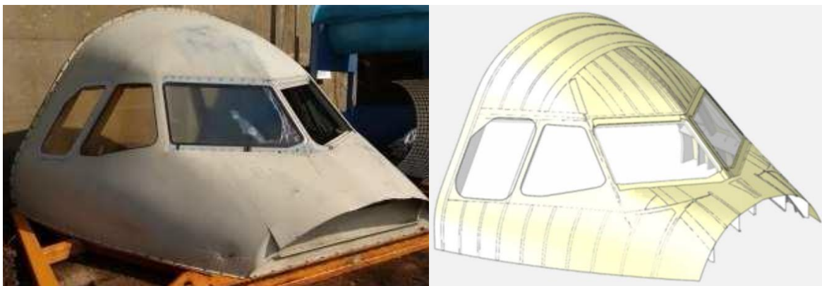
Figure 1: Airliner cockpit for impact testing (left) and computer reference model