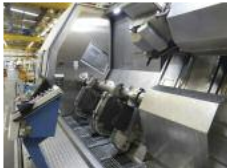
TOP LEFT - SIFCO nickel plating robot