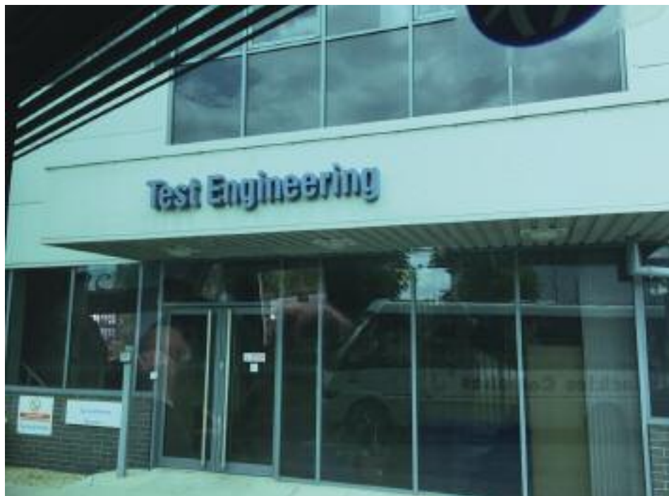
Test engineering department

Next came a brief visit to the Plating Shop. An exciting new development here