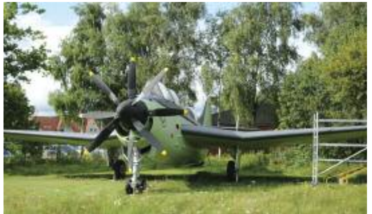
A German Gannet - the fruits of Winkle's work

beach and swam in the tideless and salty waters of the Baltic, over which those V1s and V2s were launched all those years ago.