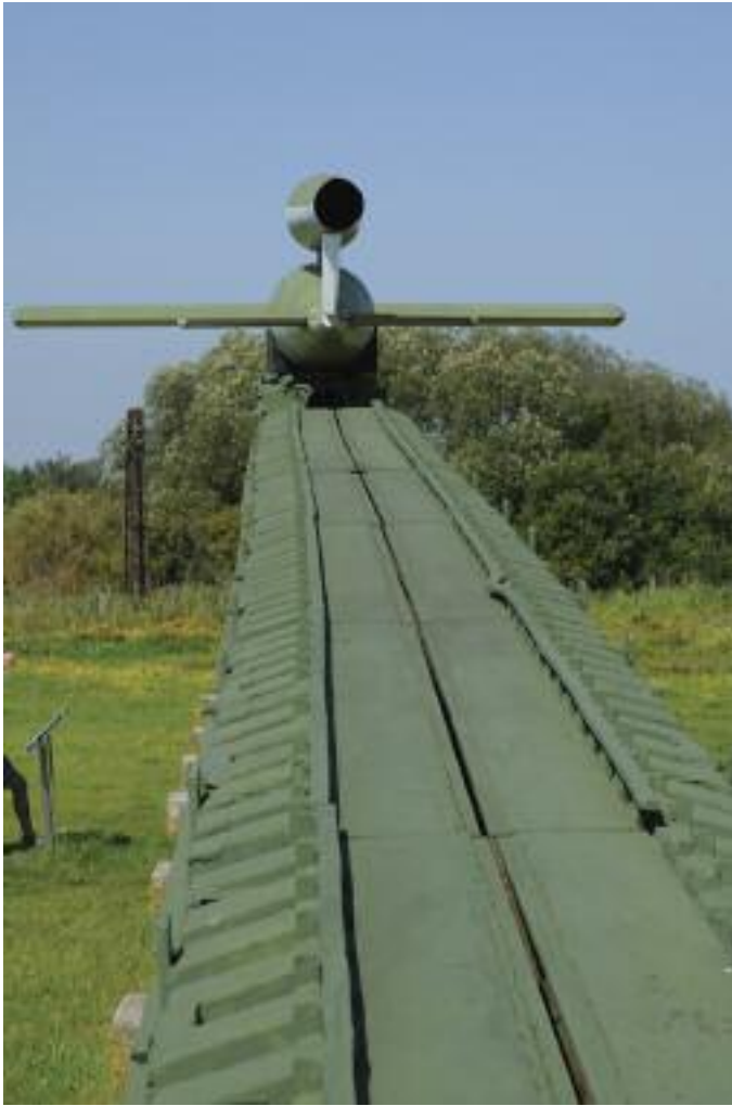
V1 on ramp (acquired from the UK)