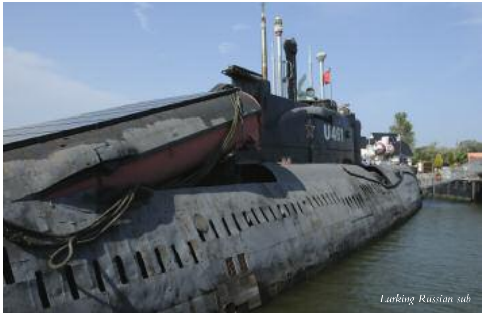
Lurking Russian sub

controller was working like a one-armed paper-hanger, dealing with aircraft from Land's End to Dover to way up in the Midlands. It was almost impossible to get a word in edgeways so it was with some relief when we coasted in near Yarmouth to change to the quiet of Tibenham's frequency. As we approached the westerly runway to land I was glad to see my Morris Minor still parked by the hangar after four days away. Our total flying hours were 9hrs 5mins, we visited two fascinating places and learnt much. My great thanks go to the Editor for asking me along.