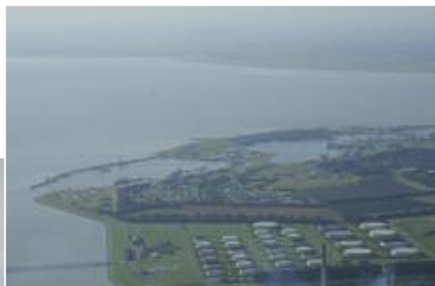
Wilhelmshafen, an early Bomber Command target