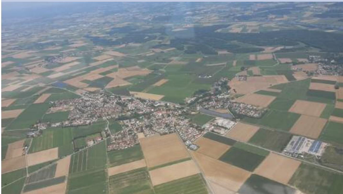
Editor's photo of Strasskirche below

On my return route from a summer visit to Austria, I deviated only 5 miles from my direct route to fly over Strasskirche, the (then) little village outside Straubing where Melitta met her maker. There was no geographical cover for her to escape the P47 Thunderbolt that was pursuing her. If she had only been 15 miles to the East, woods and small mountains would have given her hope.