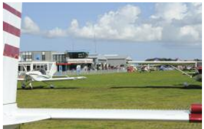
A busy Texel