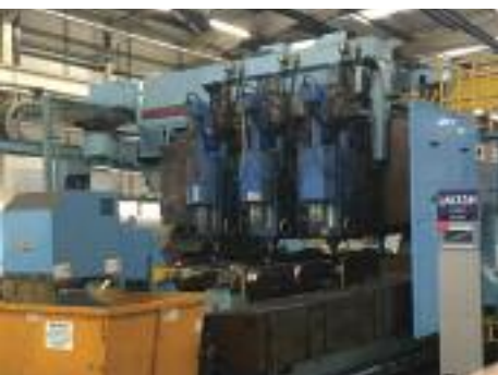
BOTTOM RIGHT - A bored forging