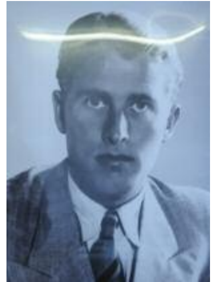
Werner von Braun, rocket supremo