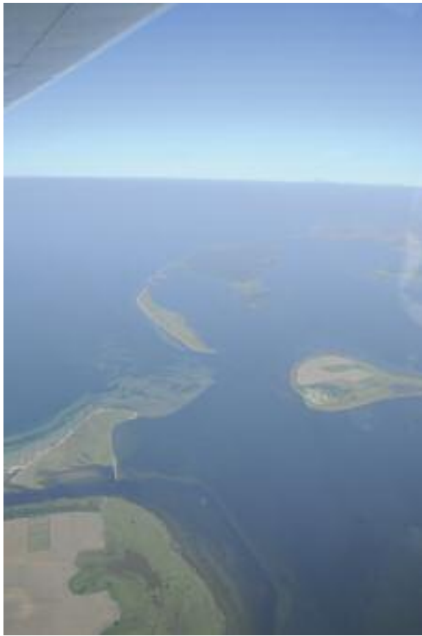
The German archipelago