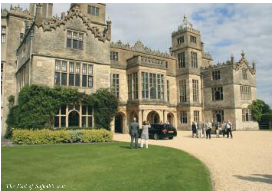
The Earl of Suffolk's seat