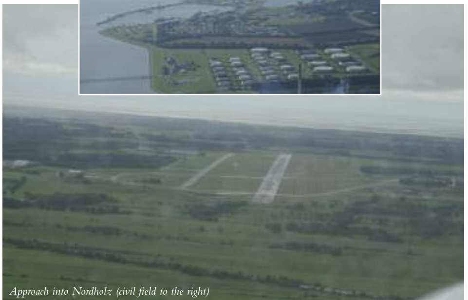
Approach into Nordholz (civil field to the right)