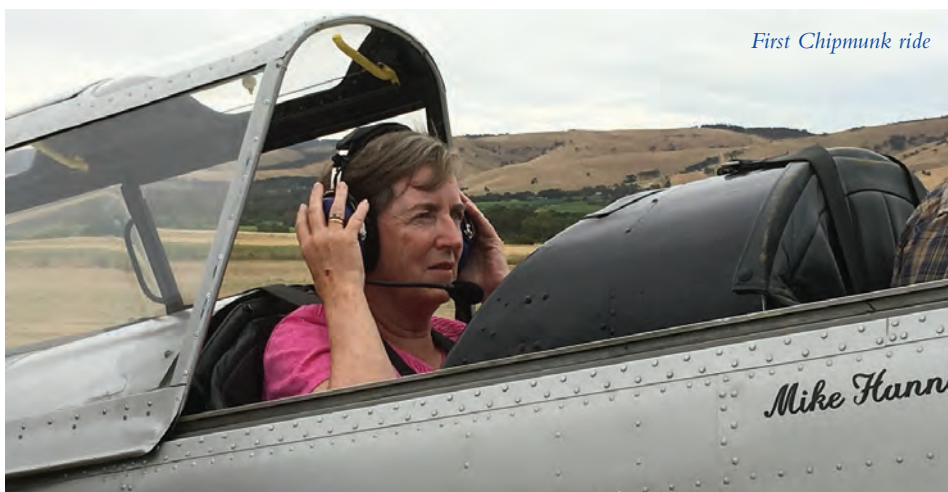
First Chipmunk ride

Two days after the Trophies and Awards which, as always, was one of the highlights of the year, we set off on the second leg of the tour. New Zealand, Australia and Hong Kong. This was my first visit to New Zealand and what a beautiful island it is. We started in Wellington at The Wellington Club and