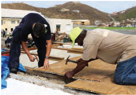
Post-disaster reconstruction by the Ship's Company – with nary a B&Q in sight