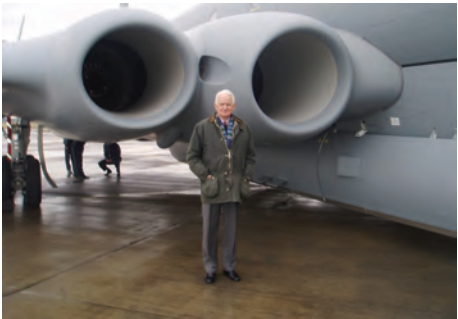
Nimrod MRA 4

Of course, additional P-8s and AAR capabilities would have to take their place alongside the other candidates for defence funding at a time of extreme financial pressures. However, the