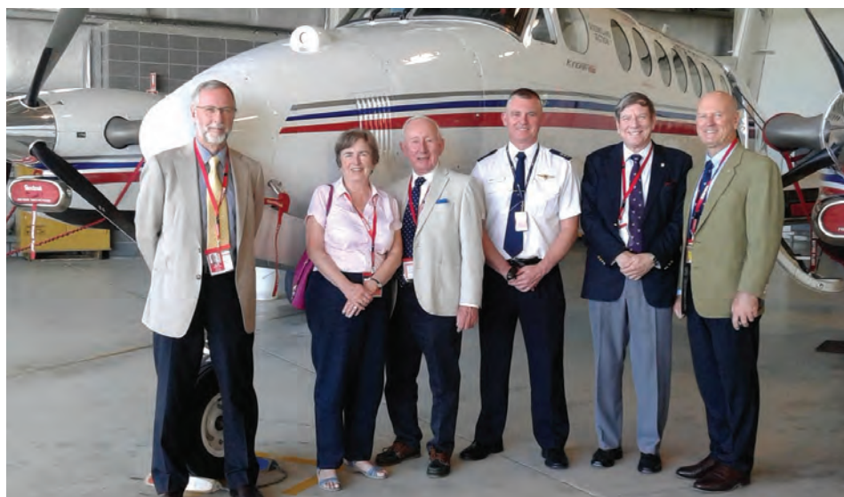
Royal Flying Doctor Service