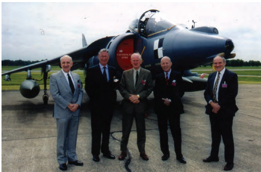
The Harrier team 30 years on