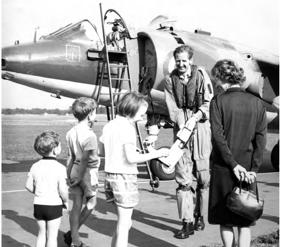
With his family at Dunsfold August 1967