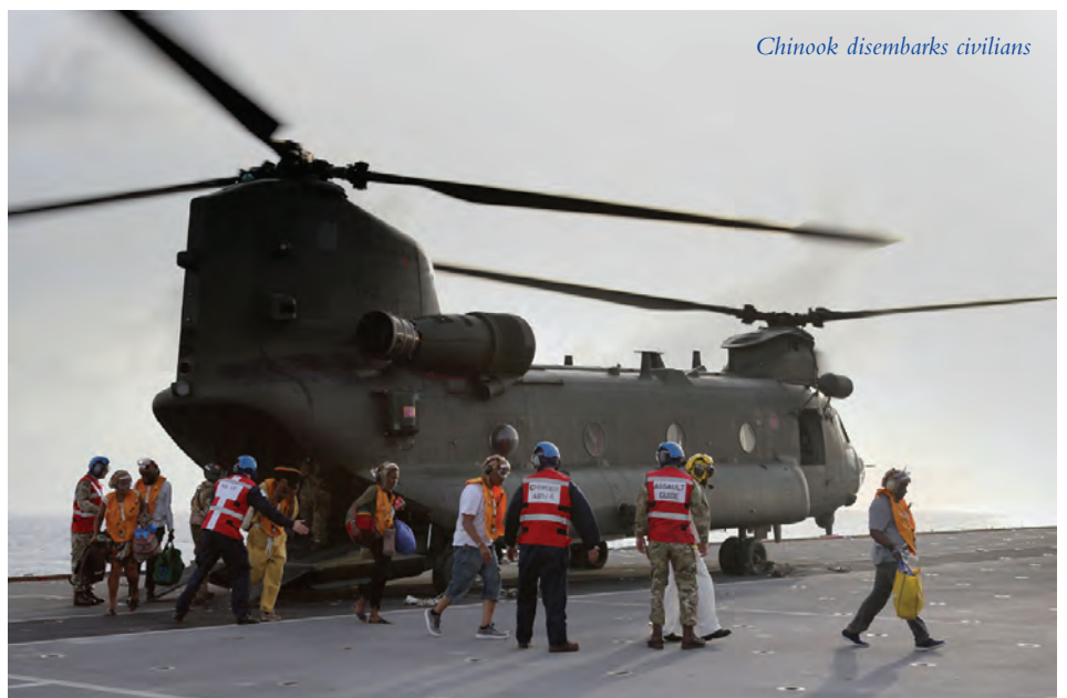
Chinook disembarks civilians