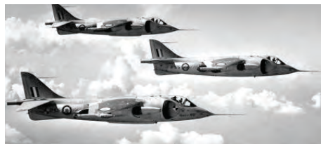
Flying the P1127 - June 1963