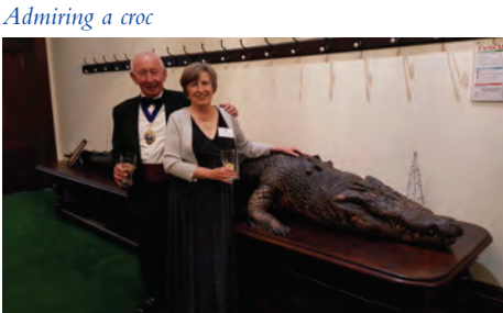
Admiring a croc