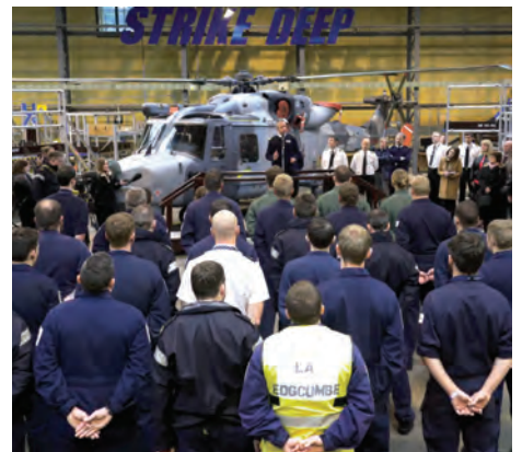
Wildcat Flight 216 is welcomed back to RNAS Yeovilton