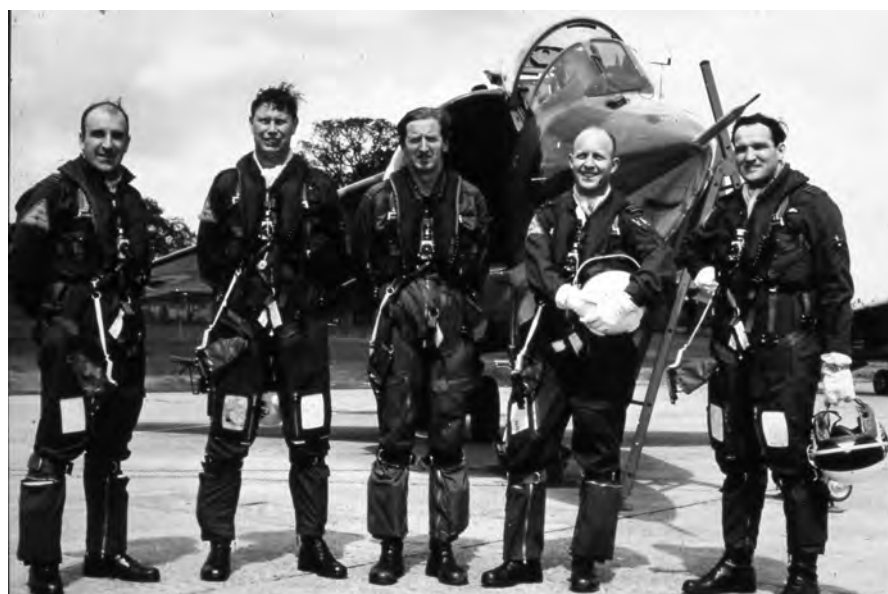
The Harrier development team