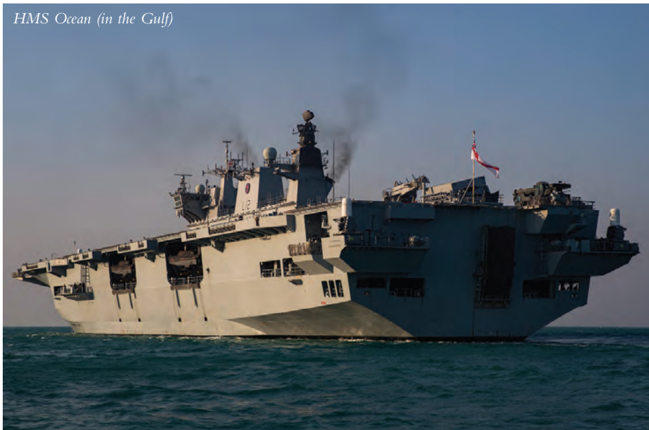
HMS Ocean (in the Gulf)