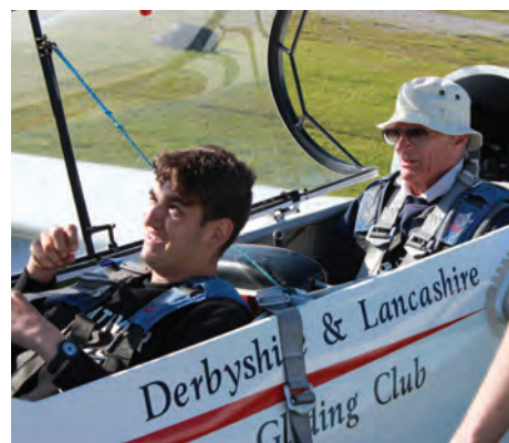
Prior to launch at Camp Hill