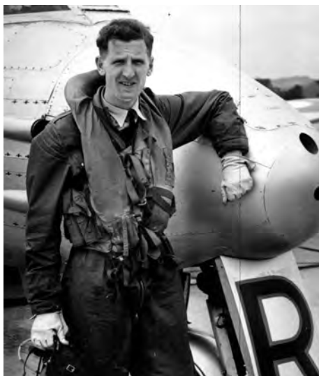
Kitted up for the Meteor in 1952