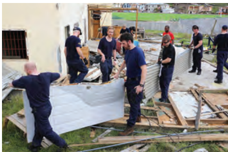
The human side of military operations