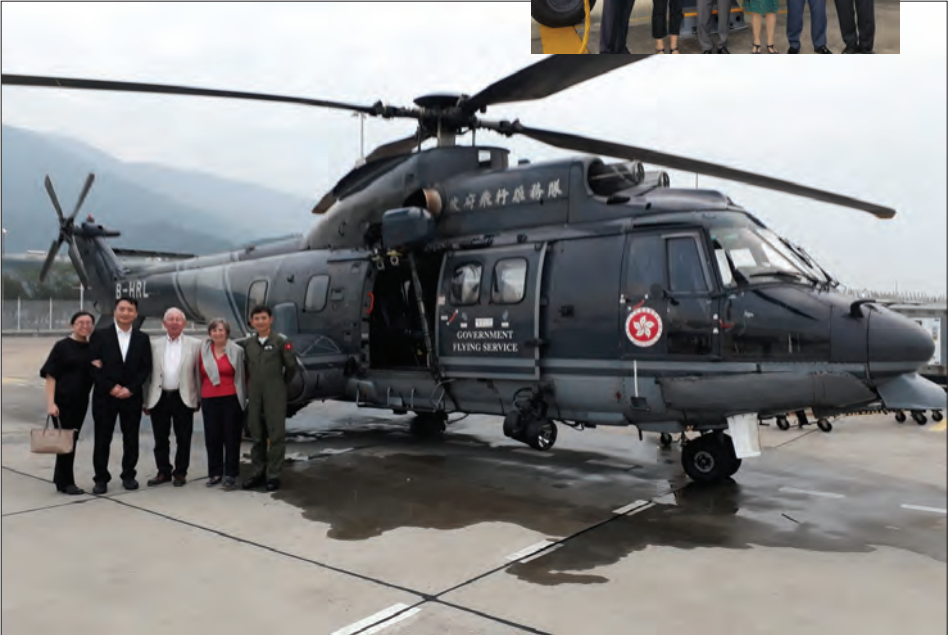
Government Flying Service Hong Kong