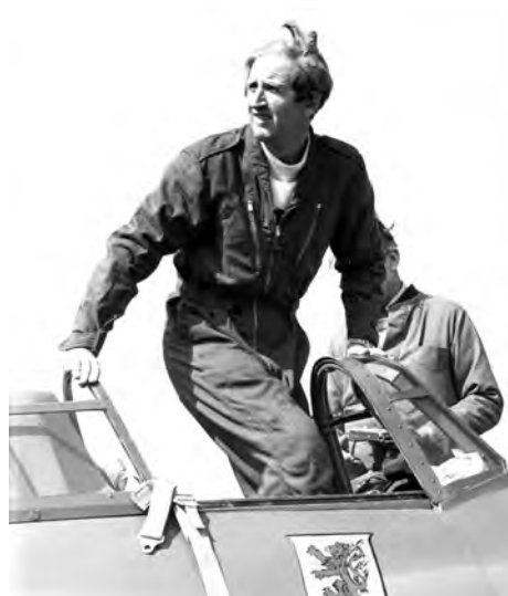
With the Strathallan Hurricane

Duncan was, naturally, central to the development of the two seat Harrier. At that time the complex fuel system of the Harrier was prone to Foreign Object blockages, and Duncan endured one on a flight from Boscombe whilst at reasonably low level. As hurried relight attempts failed, Duncan pointed it to the unpopulated Salisbury Plain; with true TP courage he stayed with it as long as possible – later drily commenting “a two seat Harrier full of fuel is not the best glider” – he trimmed the aircraft to give the softest landing possible to save the evidence of what had failed, and only ejected at around 100' (this was the first use of the Martin Baker Mk 9 seat), momentarily risking landing in the fireball. At that time, protruding cutter blades beside the seat headbox were thought to be sufficient to punch