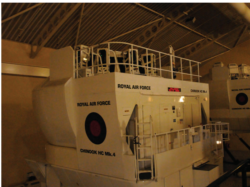
The impressive sim facility

A final wrap-up from Sqn Ldr Tim Smith completed a fascinating day for lucky Company members.