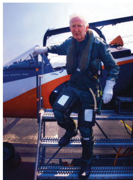
Celebrating 1m Hawk hours at RAF Valley