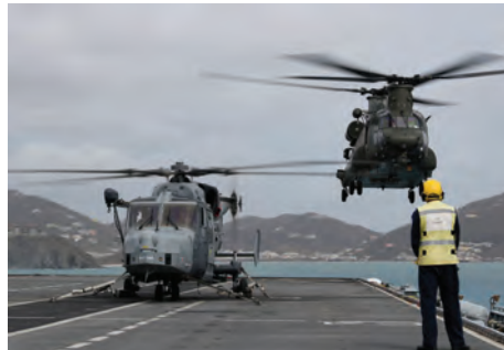
Wildcat & Chinook in operation