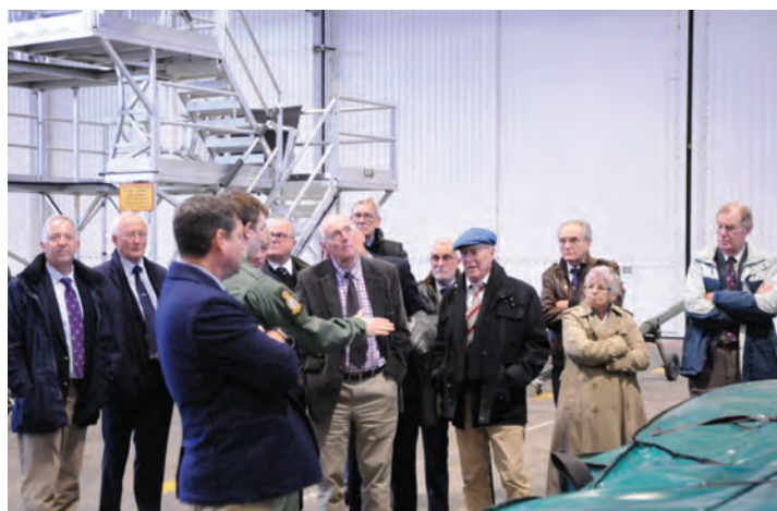
Varying levels of concentration from the Company members viewing a Puma!