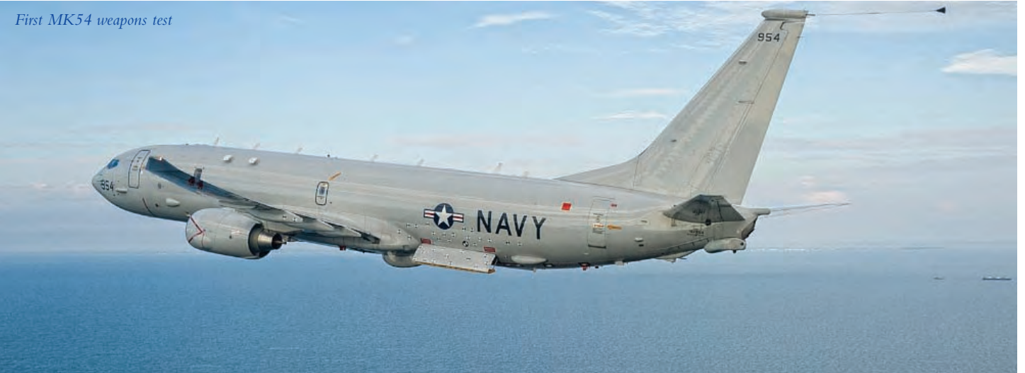
First MK54 weapons test

potential inability of our planned force of only nine P-8s to provide concurrent continuous cover to both the UK deterrent and other vital tasks, including CVA protection, represents a significant shortfall in our defence capabilities and should be an important consideration in any future adjustment of the Defence Programme.