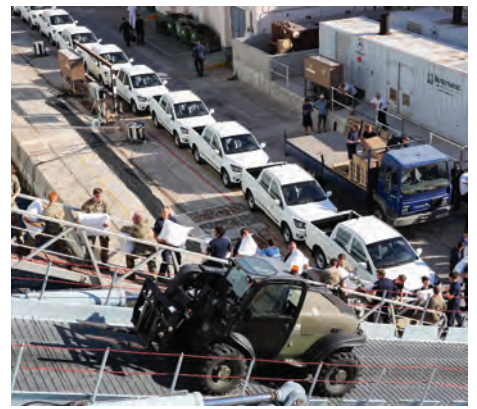
Loading disaster relief supplies at Gibraltar