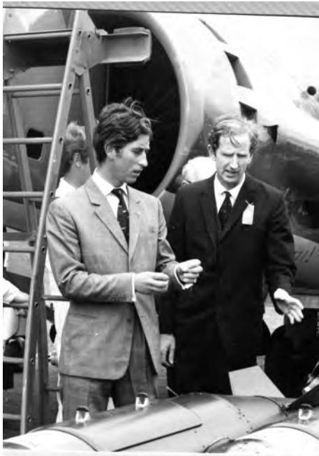
With Prince Charles in 1972