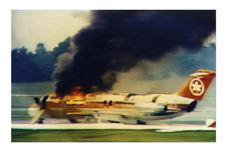
DC-9 accident - Cincinnati June 1983

In Advisory Circular (AC) 120-80A – In-flight Fires (FAA, 2014), the FAA identified that the time for the situation to become non-survivable was as little as seven minutes, and that only in one third of hidden fire events would the aircraft reach an aerodrome before the fire became uncontrollable. An example of this is the accident involving an Air Canada DC-9 which diverted to Cincinnati in June 1983 when a lavatory compartment fire became uncontrollable (NTSB, 1986).