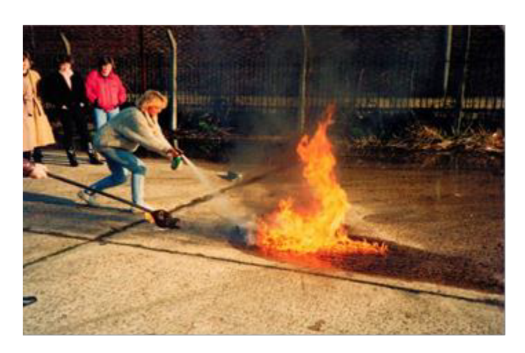
Practical fire training in the 1980s

During training in the 1980s, aircraft crew usually fought fairly large fires in the open air. At that time oil tray fires were favoured and Halon could be used. These fires were usually quite large and challenging. They could be difficult to extinguish unless the correct procedure was used, such as aiming the extinguisher at the base of the flames. Re-ignition was often a major factor. While a fire of such size would be most unlikely to occur on a commercial aircraft, it did provide an awareness of the problem and also the effectiveness of Halon.