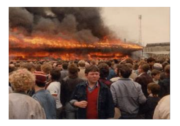
Bradford City Football Stadium fire – May 1985

There were 56 fatalities. The cause of the fire was probably a match or cigarette being dropped on debris, which then ignited (HMSO, 1986).