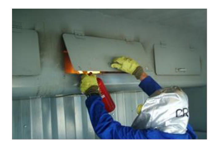
Combining fire extinguisher training with PBE training & fire gloves

Combining fire extinguisher training with PBE training is certainly feasible since some operators and training organisations achieve both elements in one practical fire training scenario. Therefore, regulatory requirements should reflect the likelihood of an in-flight fire in which different items of fire safety equipment need to be used simultaneously. Attempting to meet practical fire training requirements in unrealistic, separate fire training scenarios is not satisfactory.