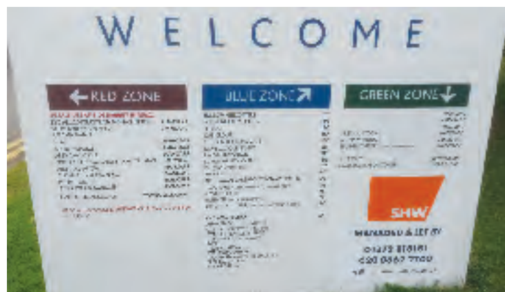
A long list of tenants at Redhill