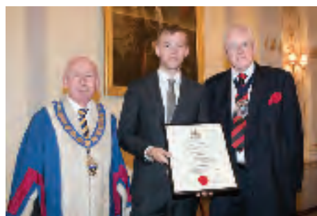
LCAS Achievement Ceremony, October