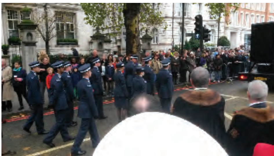
Our affiliated unit, the University of London Air Squadron setting off for round two of the Lord Mayor's Show.