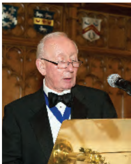
The Master's speech at Vr