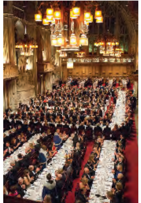
New Liverymen stand to be recognised in the Great Hall