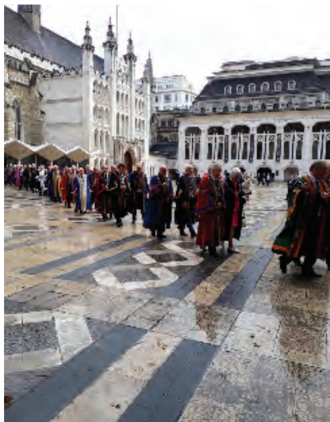
The Master in procession at the Guildhall after the election of the year's new Lord Mayor.