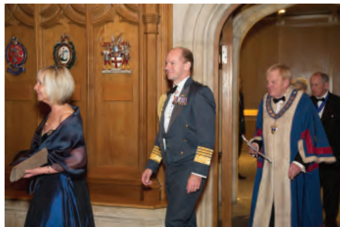
The Master follows the Guest of Honour into the Hall