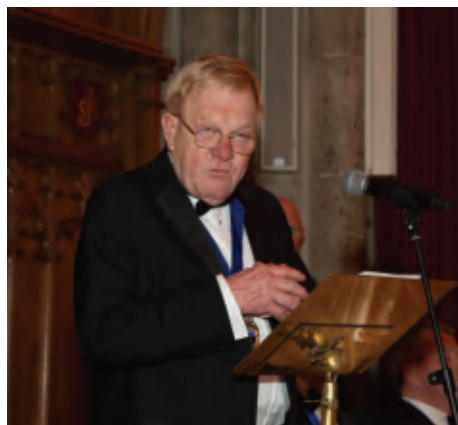
The Master launches his speech