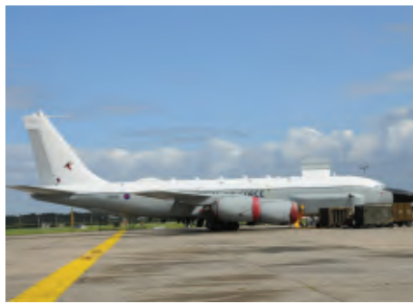
A rare sighting of a RC-135W Rivet Joint at Waddington