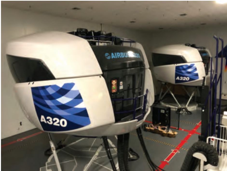
Modern full motion flight simulators at the Airbus Training Center in Miami, Florida. These simulators can be used to fully license pilots to fly the A320 without them ever having to fly the actual aircraft.

associated with training in actual airplanes, and to reduce their student's exposure to the risks of training before they had developed the requisite control skills.