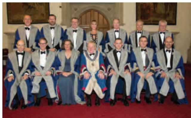
The Master with the new Liverymen