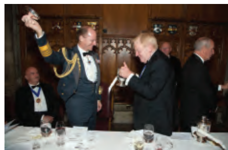
Panache (or should that be Eclat?) with the Loving Cup

The Cowdray Room at the RAF Club presented an opportunity for later conviviality.