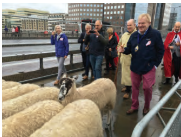
Not quite a crook - the stick that is! The Master enjoying the traditional sheep drive across London Bridge.