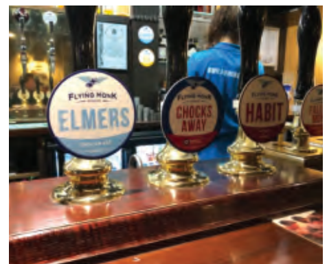
An unforeseen legacy from one of the earliest attempts at human flight: the beer selection at the Flying Monk Tavern located close to Malmesbury.