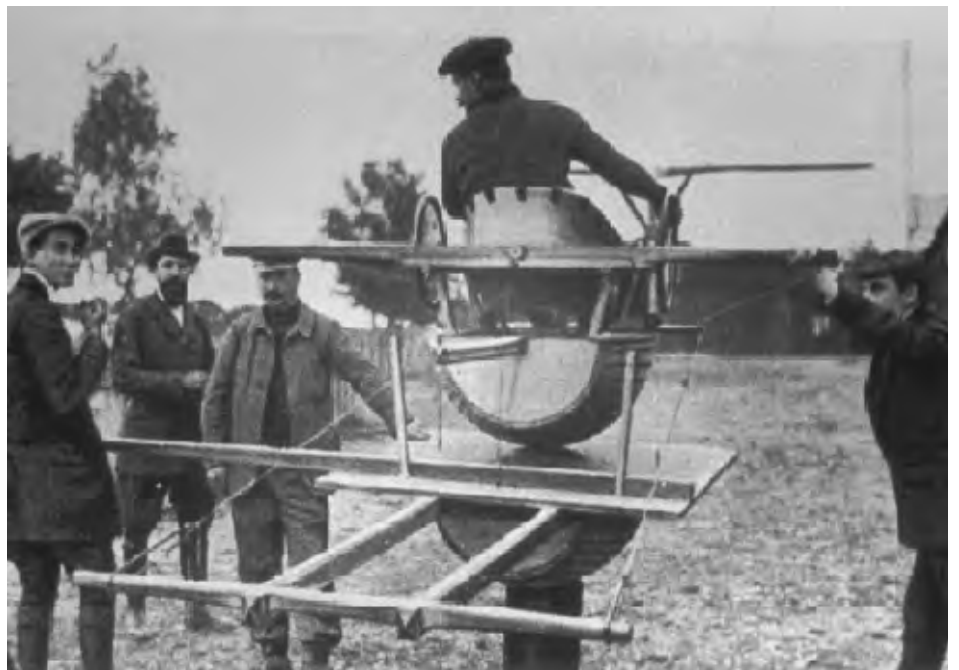
An early attempt at flight simulation by using controls to balance on two half barrels. Adapted from, Brief history of flight simulation by Page, R. (n.d.).

Prior to World War One there was no large scale pilot training system; the United States entered the War with only sixty-five army pilots and a small number of training aircraft and facilities (Brady, 2000c). The Wright brothers established