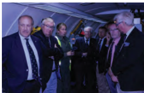
Struggling to comprehend the Sentry's capabilities