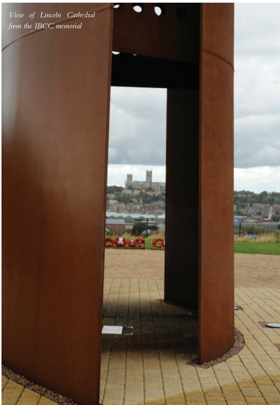
View of Lincoln Cathedral from the IBCC memorial

We dispersed after well-earned tea and buns. Thank goodness the weather was more clement for our return.