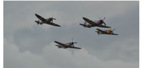
D Day Aircraft – Spitfire, P51 Mustang, P47 Thunderbolt and Messerschmitt Bf-109