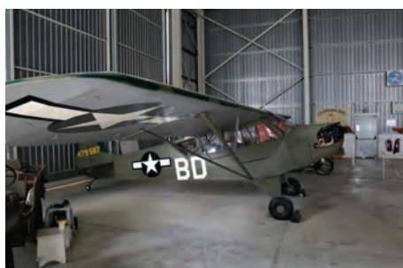
Piper L4 Cub