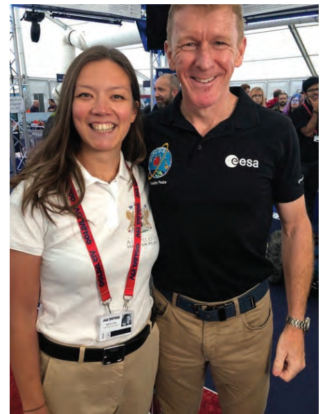
Invaded by a star: Tim Peake