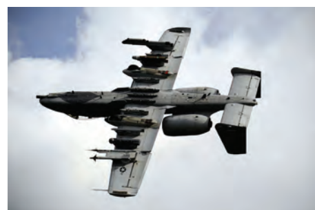
Fairchild Republic A10 Thunderbolt "Warthog". The most frequent performer in the air display was somewhat surprisingly this ground attack close air support machine which went out of production in 1984. Since Oshkosh a $999,000,000 contract has been signed with Boeing to rewing.