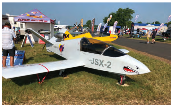
SubSonex single-seater jet