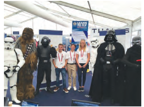
Star Wars invaders

Saturday promised better weather, and the busiest day of the show was reflected at our stand. Despite more air displays, we maintained a steady stream of business with many young people and their families passing through. The tantalising sound of fast jets and display teams roaring overhead saw our volunteer team rotating in and out to have a gander at the air displays. A mass exodus was seen to watch the Red Arrows and BA100 BOAC-liveried Boeing 747 flyby. It was a stirring moment of inspiration for our team of young pilots, most of whom are still at some stage of training, young hopefuls gazing up at the pinnacles of both commercial and military aviation. Other highlights among our volunteers included the A400M doing mind (and