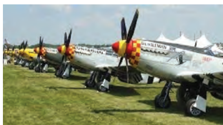
A gaggle of P51's