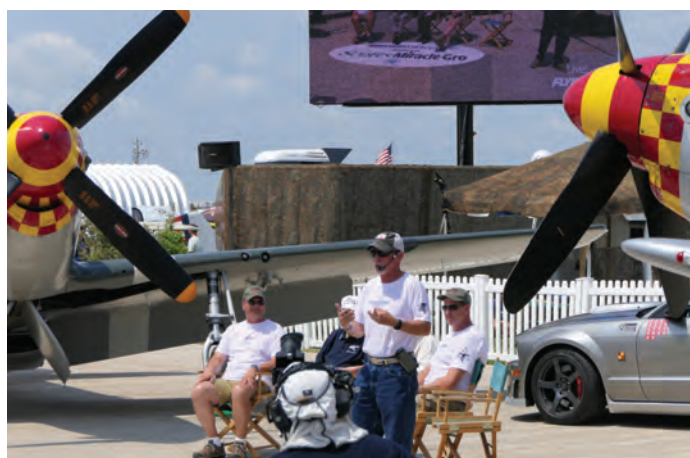
Warbird in Review