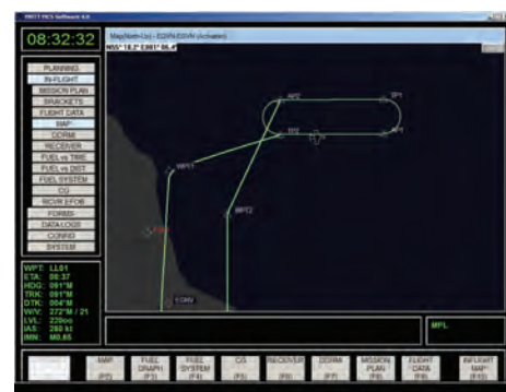
Imagery obtained by use of the A310MRTT Mission Computer System software

After pushing back at 0825 local, we were soon airborne from Brize Norton's RW25, the astonishing performance and quietness of the Voyager bearing marked contrast to the 'roar of the four' of the VC10 - something for which the local population is extremely grateful as noise complaints are virtually unknown these days, we were told. After completing the Standard Instrument Departure, our route took us to Whitegate, a waypoint in Cheshire, from which we crossed Manchester's airspace at FL220 to the Pole Hill VOR, before turning overhead RAF Leeming to fly north to a waypoint off the coast near Alnwick in order to remain clear of the exercise area, then direct to the refuelling area: