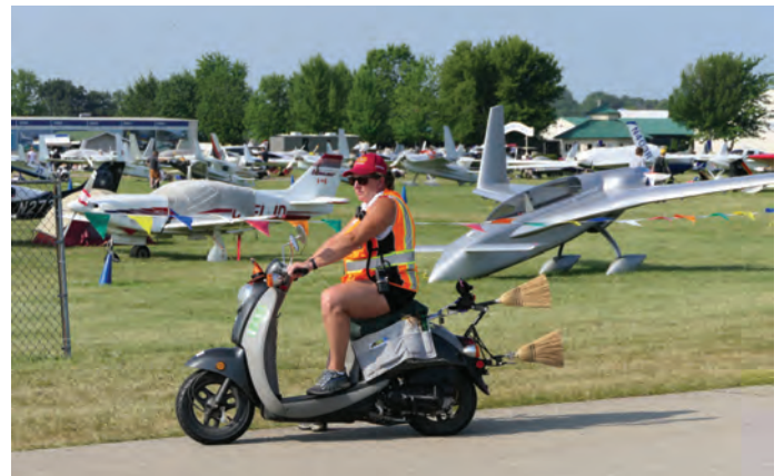
Volunteer marshal "broom-assisted" scooter