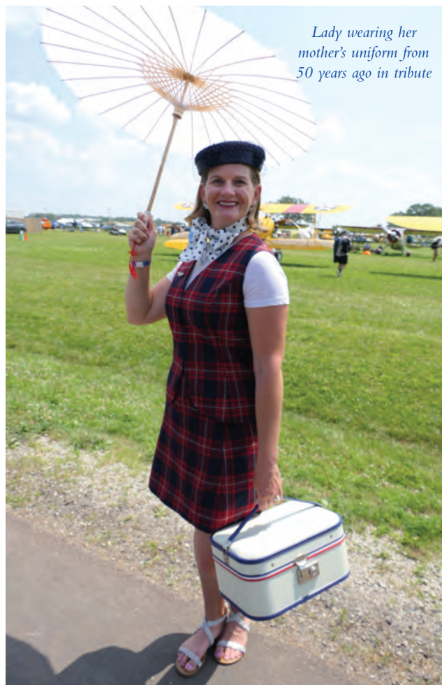
Lady wearing her mother's uniform from 50 years ago in tribute