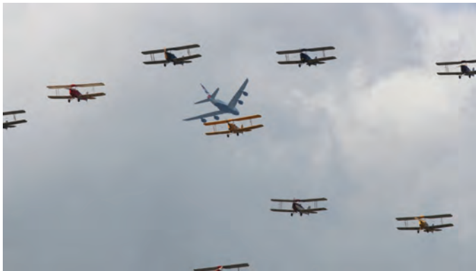
Tigers (and one Moth Major DH60) forming with a BA 747-400? Or other way round?