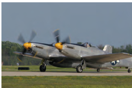
P-82 twin-engined Mustang – designed as a long- range fighter as escort for bombing raids. Sadly/fortunately the war ended long before production units were available.