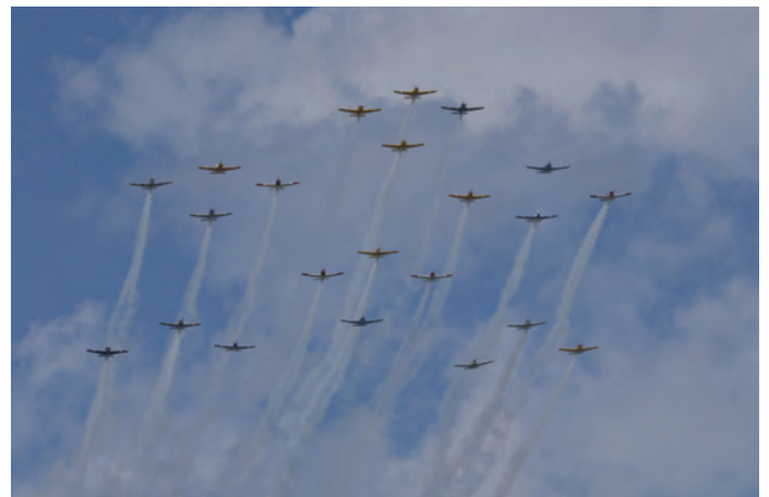
One of many large formations