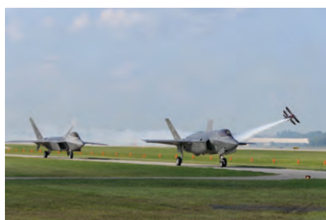
F22 Raptor on left & F35A – Lightning II