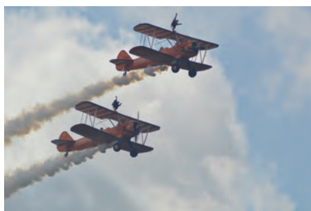
AeroSuperBatics Wingwalkers - based in Cirencester