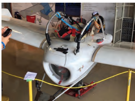
M-02J Japanese designed and flown weight-shift jet powered