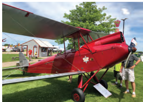
DH60 Gipsy Moth

Throughout the day there are thousands of workshops and forums going on where you can learn welding, riveting, fabric covering and painting techniques, electrical wiring and countless other skills to build your own aircraft. There are even stations near the museum for children to try their hand at these skills under supervision. I saw one group of youngsters rivet an aluminium plate with an EAA wing pin in the middle with pneumatic tools.