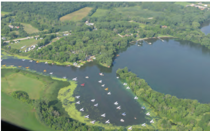
Seaplane Base from the Ford Trimotor