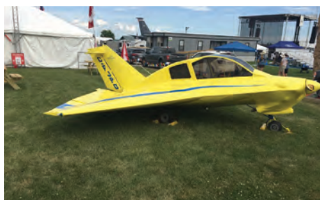
Homebuilt Dyke Delta JD-2 1960's design - only 50 built

Some of the more quirky/interesting aircraft: