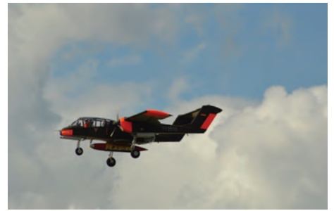
North American OV-10 Bronco