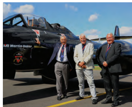
Three chaps who have a lot for which to thank Martin Baker!

The jet crashed in the only farmyard for miles around, without injuries, and did not burn, the fire warning was, in fact, false due, I believe, to moisture in the sensors.