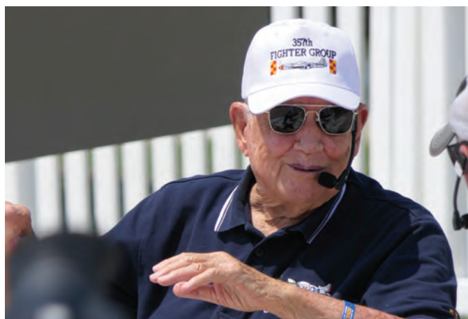
Col Bud Anderson

The actual display flying splits essentially into warbirds, aerobatics and homebuilt parade passes. Particularly in terms of warbirds, you should think volume rather than spectacular or graceful routines. There often will be three formations of T6s, T28s and T34s doing passes at different heights and directions to start the warbird section. When they launched 18, yes 18, P51s it saw three formations passing above the crowd whilst a simple tailchase occurred over the runway. Pyros featured with some aircraft such as the A10s and B25s, to simulate an attack. It was perhaps the P82 (Twin Mustang) that got closest to the sort of flying display we enjoy in the UK. It was interesting to note that although there was a massive