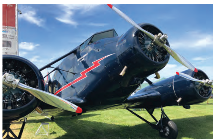
Stinson Model A