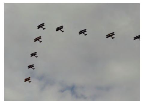
The Tiger 9 – 8 Tiger Moth DH82A and the one Moth Major (can you spot it?) (Photos of the Tiger Diamond Nine courtesy of Howard Cherry)