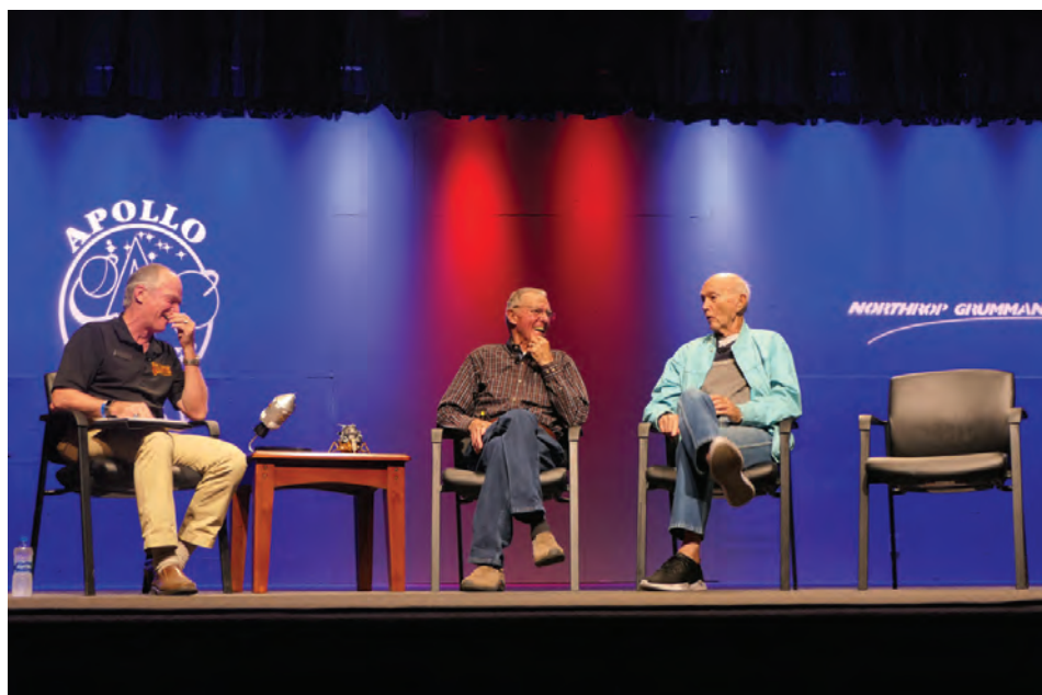
NASA astronauts Charlie Precourt, Joe Engle and Michael Collins

Both Mike and Joe aimed to become test pilots at Edwards Air Force base – “the place to be”. When Joe arrived, Mike was already there and they were scheduled to fly together for Joe's Area Orientation check-out. Joe was determined to impress and planned extensively, including setting up multiple maps on a special kneeboard. They walked out to the F104 for the check flight, Mike being ready to fire up before Joe had even strapped in! Soon after take-off, Mike offered Joe control, and not wishing pass up flying time, happily agreed. However, the kneeboard was proving rather an obstruction so he decided to take it off