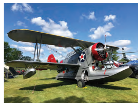
Grumman J2F Duck – used by all branches of US military & the Argentine Navy