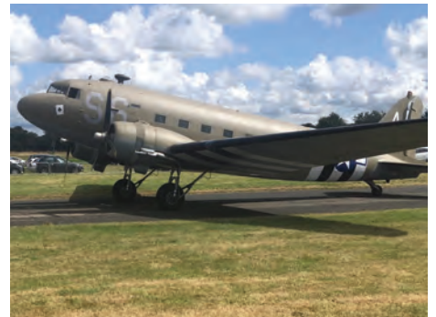
'Dak' - One of 13,000 DC3/C47s ever built