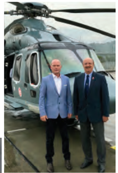
The Master and Chairman at the Government Flying Services