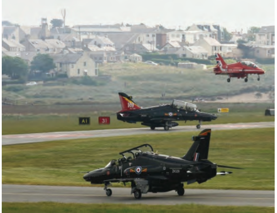
Valley is also used by the Reds mainly for the use of its sims, and was the scene of the Red's crash in March 2018

The old style of the Military Flying Training System left a big gap in piloting skills developed on the analogue Tucano and Hawk T1, from which students struggled at the Typhoon OCU. It took