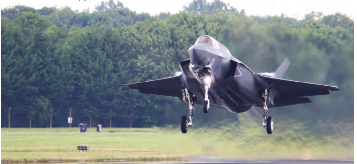
The F35A version in conventional flight

and impressive visit. It was wonderful to see the enthusiasm of all involved with the F35, clearly it is a world leader in combat air and it puts the RAF and RN at the forefront of offensive, low observable war fighting capability. The Company's grateful thanks go to the Station Commander and his team for allowing us such a valuable insight into this brand new defence system. It was also particularly gratifying for your correspondent to find that three of the senior staff at Marham had once been his students, the Station Commander on his basic flying training course at Linton on Ouse in 1993, and OC Engineering Wing and OC 9 Squadron from my days as an instructor on Cambridge University Air Squadron.