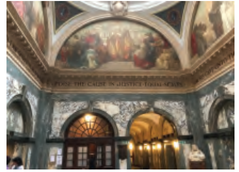
Great Hall with scripture

The Old Bailey is actually officially the Central Criminal Court, the name it gained in 1834. However it is popularly known as the Old Bailey from the road it