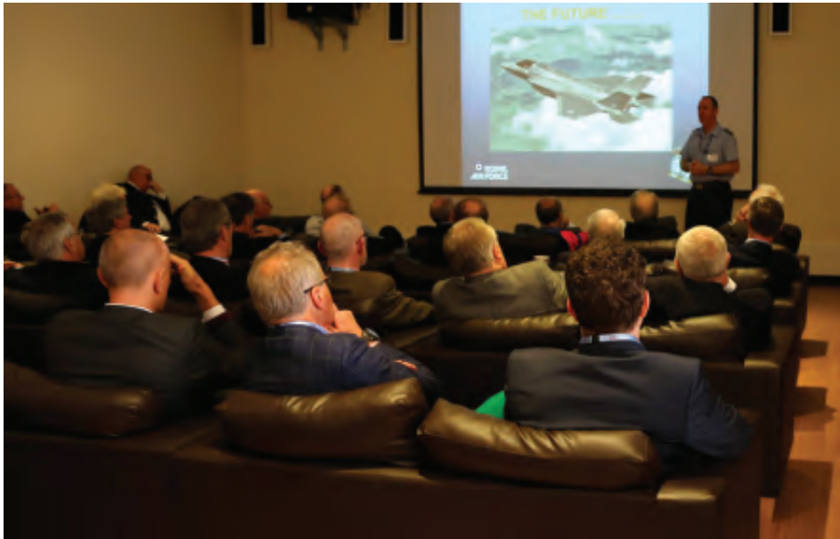
WO Howard describing the F35's amazing capabilities

was 617. The F35's weapons currently included Paveway 4 Precision Guided Munition, ASRAAM, AMRAAM and soon the Meteor AAM and Spear 3, a long range PGM that gave enhanced capability over current weapon systems. There are a number of other units based at Marham in addition to the Lightning Force, No 2 ISR Squadron consisted of intelligence analysts, 93 Expeditionary Armament Squadron was responsible for storage, generation and deployment of high readiness weapons for the whole of the RAF, the RAF Regiment was represented by HQ 3 Force Protection Wing and 2620 Squadron RAux AF Ops Support squadron.