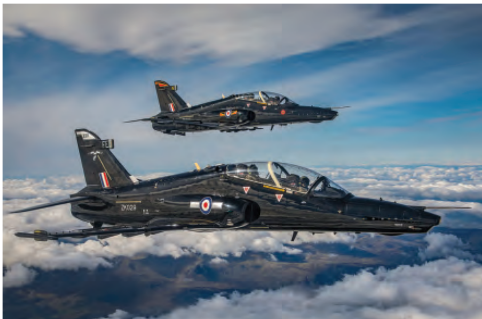
Valley's Hawk T2s in action