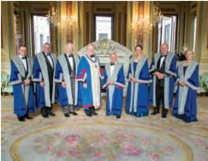
The Master with the new Liverymen