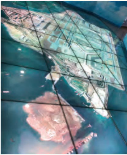
CLK glass floor

A round up of the Immediate Past Master's last Masterly duties