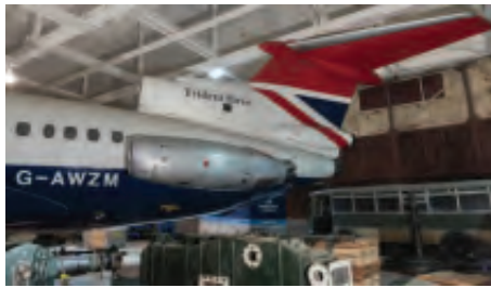
Tail of the Trident aircraft in storage at the National Collection Centre

The Hawker Siddeley HS 121 Trident 3B (G-AWZM) was acquired from British Airways in 1986 after flying 22,956 hours, covering nearly 12 million miles since it first flew in 1971. This aircraft is the only complete Trident held in a UK national museum collection.