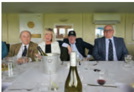
Happy Eaters - Flying Club lunch

Marshall Aerospace announced in May that it would be relocating from its Cambridge Airport site, where it employs 1,200 staff. The parent group, much encouraged by Cambridge's council, intends to redevelop the airport for housing. The Aerospace division is looking at Cranfield, Duxford and Wyton as potential new location. It would appear all those three would require substantial new hangarage to meet Marshall's needs, and Duxford's runway looks a mite too short (1500m vs 1965m at Cambridge).