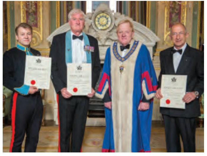
The Master with the new MAP holders

good; one of the few organisations that still hold the public trust in these times of fake news – and they have the power to change lives.”