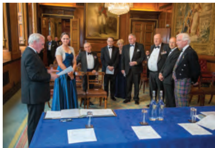
The Clerk tells about-to-be Liverymen the rules of the game