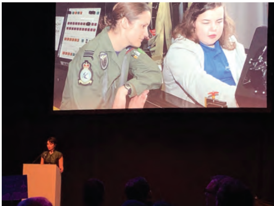
The Trust's work explained

Finally at 1.00 am a rather special event in aid of a very special cause ended.