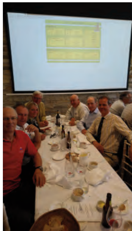
The team at a well-earned lunch