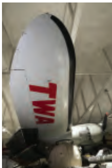
Wing of the Constellation aircraft in storage at the National Collection Centre

And do you want to open it up for public access? The Science Museum is seeking UK partners to publicly display three significant aircraft from its national collection. A Trident, Comet and Constellation are being made available for loan in order to increase access to objects from the Science Museum’s collection for audiences across the UK.