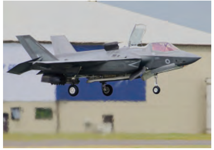
An F35b at RLAT

the hardened operations buildings (PBFs) had been demolished, no easy task as they were designed not to be. The contractor had to devise a new method involving injection of chemicals into the structure to decompose the building from inside. We also passed the old Cold War relic of the Special Storage Area for nuclear weapons, guarded by a double perimeter fence, numerous alarm systems and at the time housed thirty armed RAF Police. Now no longer in use it is likely to be developed into something more useful for the 21st century. Nearby was the new Lightning Operations Centre for the F35, recently opened by Her Majesty the Queen. Evident on the route were signs of the Tornado GR4's departure from active service in the shape of RB199 turbo fans and Tornado drop tanks that