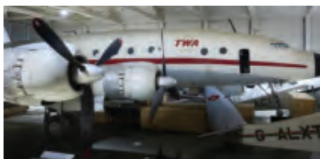
Lockheed 749 'Constellation' serial no. 2553, built September 1947. This Constellation of Trans World Airlines (TWA) is pictured at the Science Museum's Wroughton airfield in Wiltshire.

The Lockheed 749 Constellation (N7777G) is the only complete Constellation in the UK. It was flown on KLM's long-haul passenger routes from 1947, before being converted to include freight service and operating from Alaska.