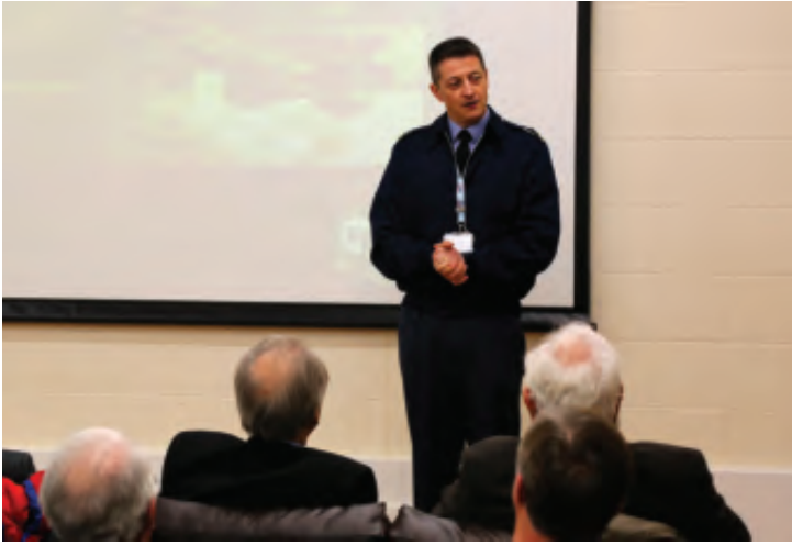
The Station Commander welcomes the Company

the hardened operations buildings (PBFs) had been demolished, no easy task as they were designed not to be. The contractor had to devise a new method involving injection of chemicals into the structure to decompose the building from inside. We also passed the old Cold War relic of the Special Storage Area for nuclear weapons, guarded by a double perimeter fence, numerous alarm systems and at the time housed thirty armed RAF Police. Now no longer in use it is likely to be developed into something more useful for the 21st century. Nearby was the new Lightning Operations Centre for the F35, recently opened by Her Majesty the Queen. Evident on the route were signs of the Tornado GR4's departure from active service in the shape of RB199 turbo fans and Tornado drop tanks that